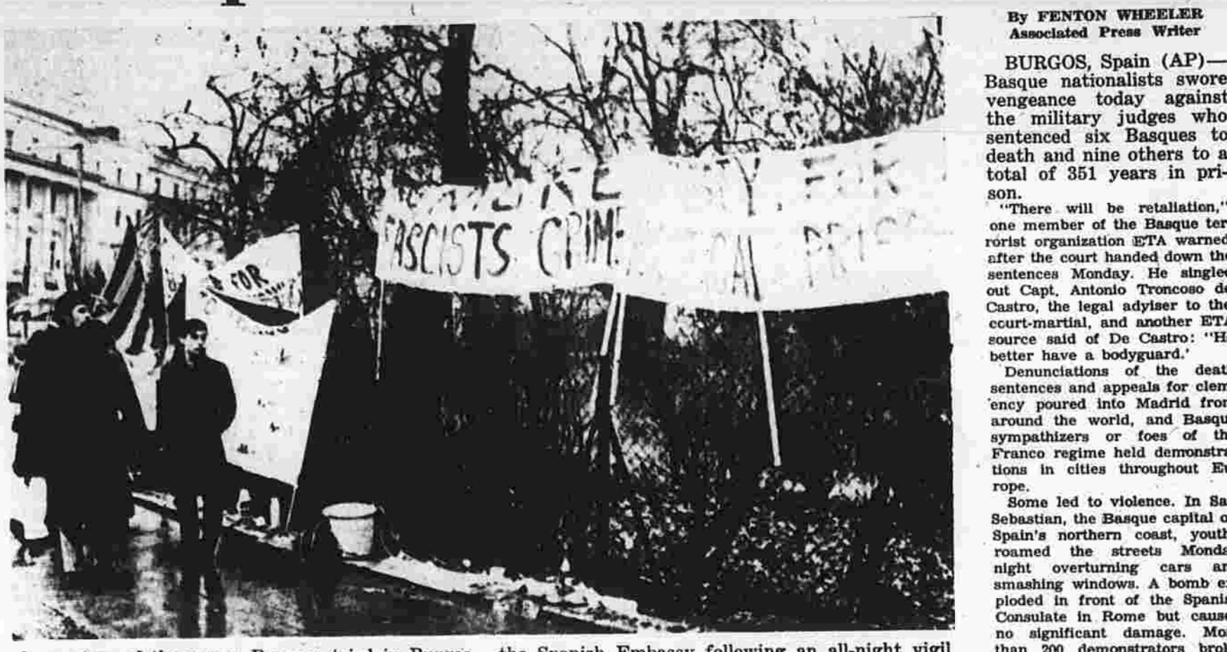
Supporters of the young Basques tried in Burgos the Spanish Embassy following an all-night vigil stand in the rain with protest banners opposite after death sentences were announced.