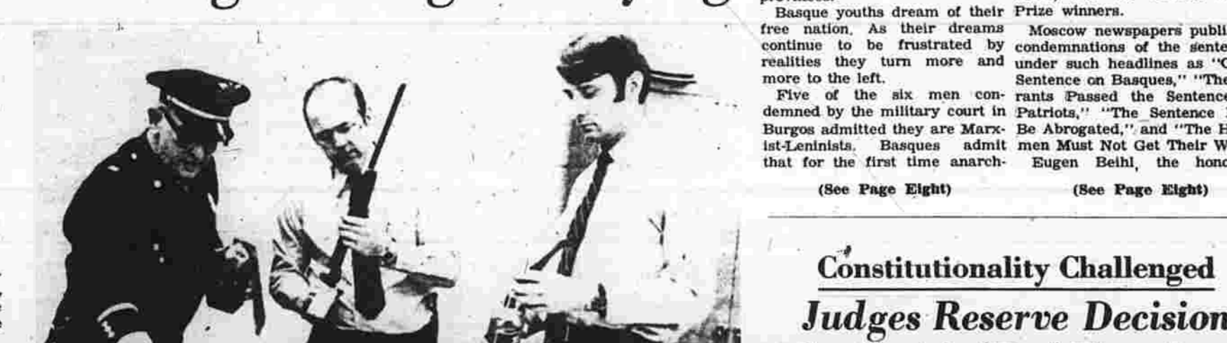
Police examine arsenal of fire bombs and weapons along with dynamite, guns and $5,100 in money confiscated after Georgia shotgun slaying.